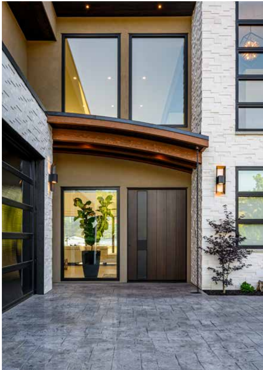
Featured Product – Myra Limestone, 3D

TIER® 3D is an ultra-modern panel that captures shadow and depth from its unique varied stone sizes. Comprised of precision-cut natural stone, these interlocking contemporary panels are hand-assembled with absolute precision. 3D from TIER® is perfect for commercial and residential facades, fireplaces, outdoor kitchens and many other interior or exterior applications.