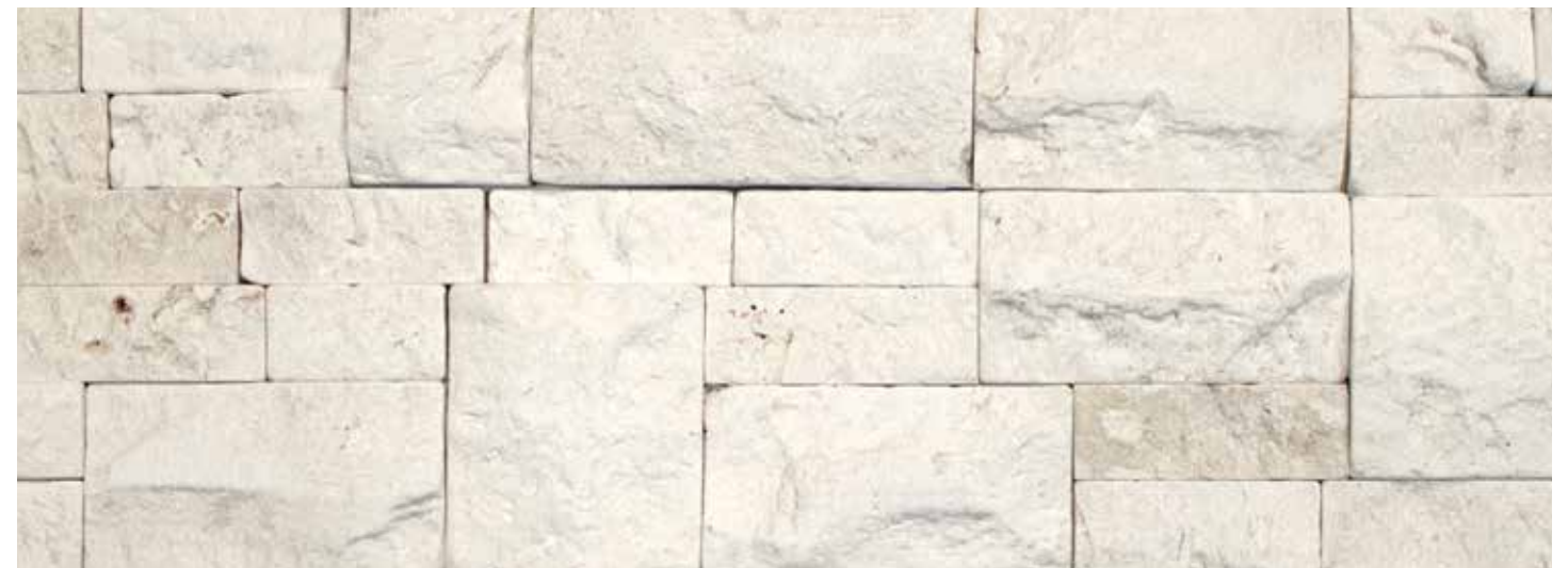
MYRA LIMESTONE Limestone