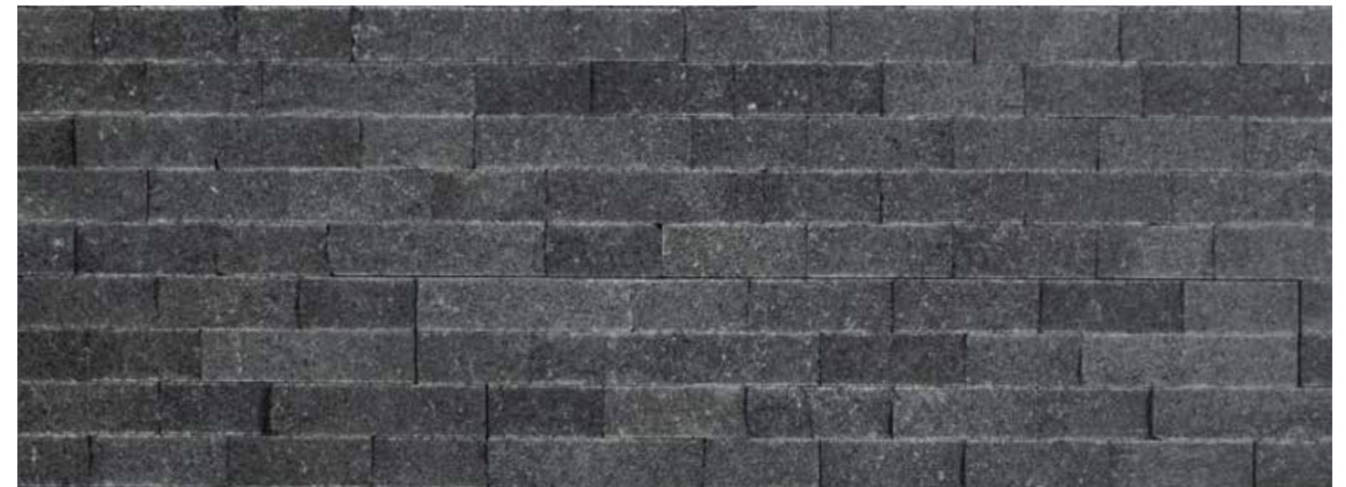
GREY BASALT Basalt