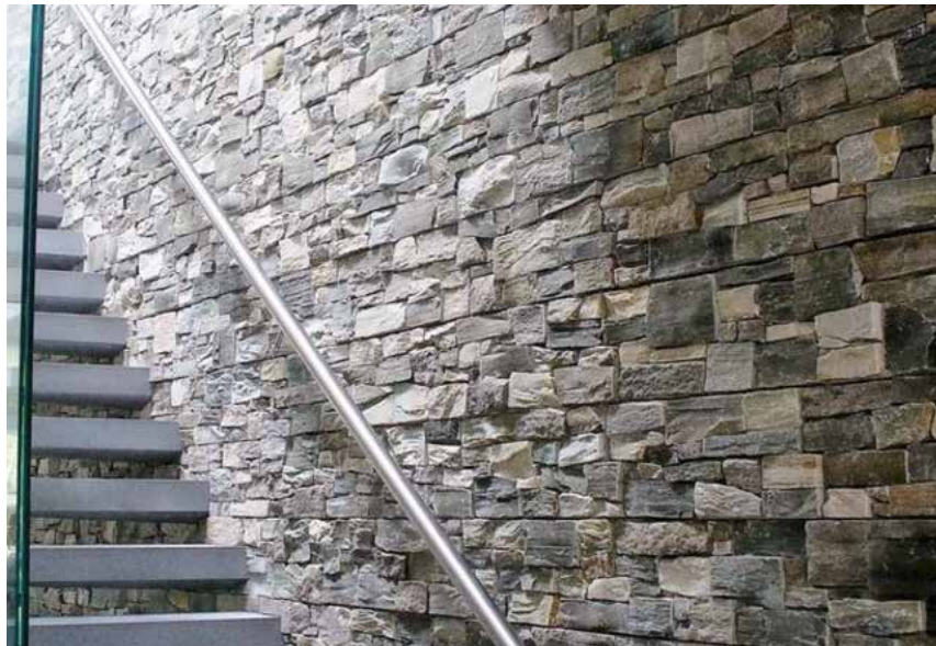
Featured Product – Nordic, TRADITIONAL

TIER® Traditional is a classic stone panel that offers a rugged yet tailored look. Flat panels have a unique bow-tie shape versus a rectangular shape. Comprised of three panel components: Flats, Corners and Starter Strips, these modular shapes fit seamlessly together, eliminating the need for specialized labor. Traditional from TIER® is an ideal option for residential and commercial exteriors, outdoor living applications, fireplaces, feature walls, and more.