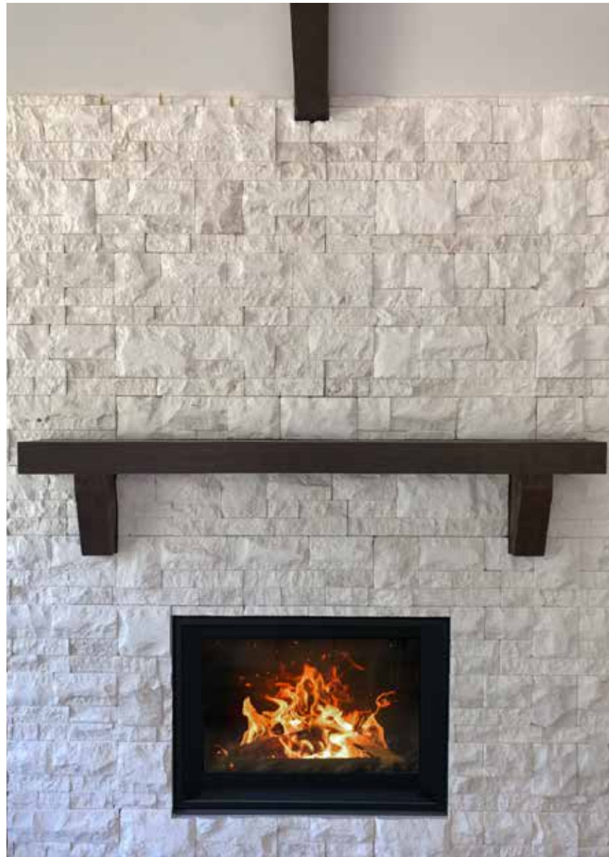
Featured Product - Myra Limestone, CRAFTED

TIER® Crafted is a rugged yet modern panelized stone veneer. Each panel is composed of several individual stones that have been dressed by hand, exemplifying a truly hand-crafted panelized stone veneer. Crafted from TIER® Natural Stone is perfectly suited for exterior façades in creating curb appeal, as well as interior applications like feature walls, backsplashes, fireplace surround and more.