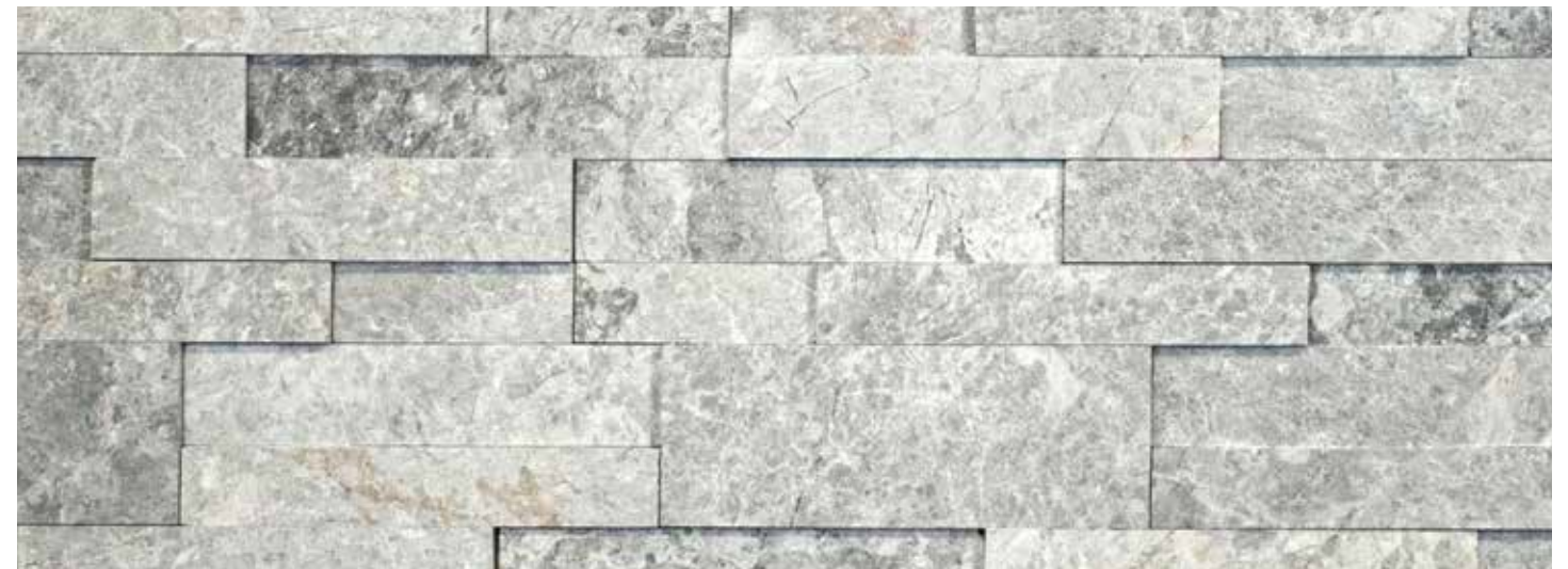
TUNDRA GREY Marble