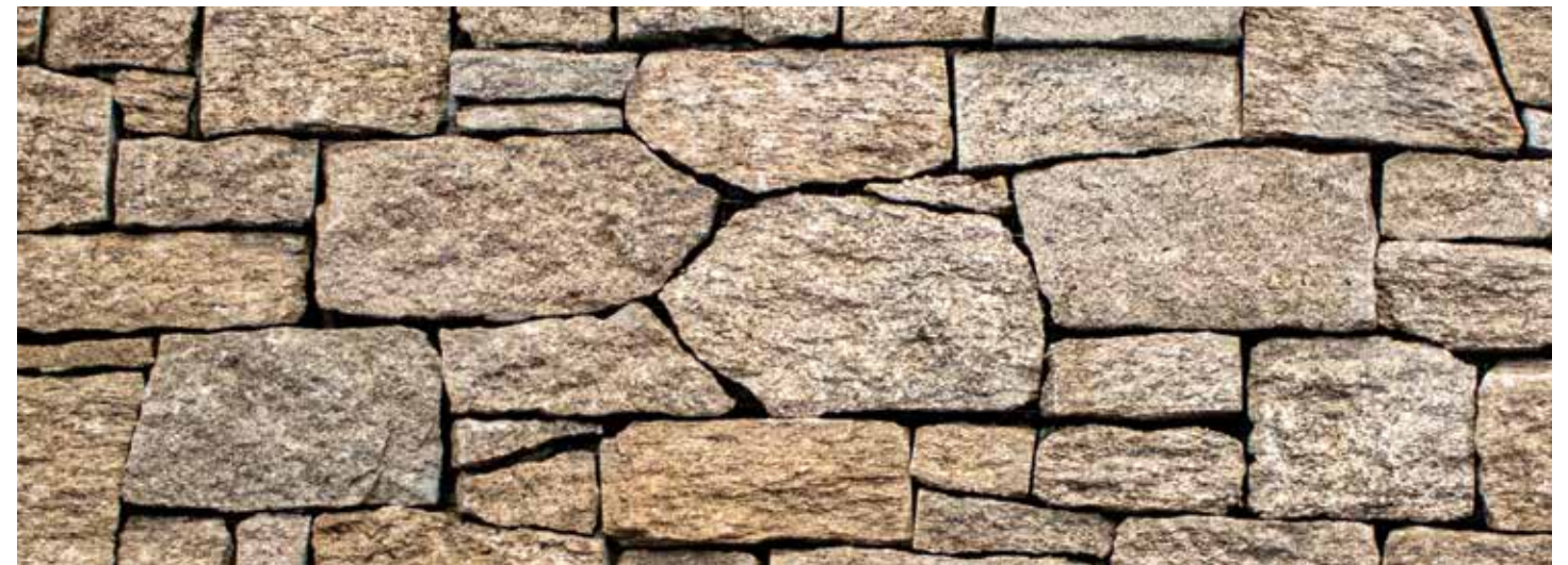
RUSTIC GRANITE Granite