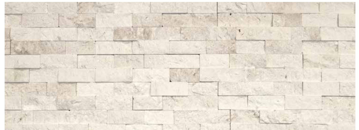
MYRA LIMESTONE Limestone