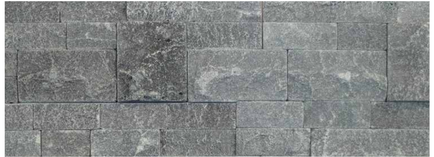
GREY BASALT Basalt