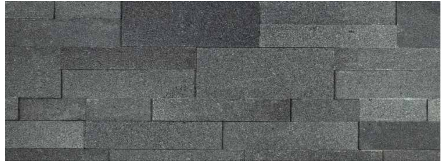
GREY BASALT Basalt