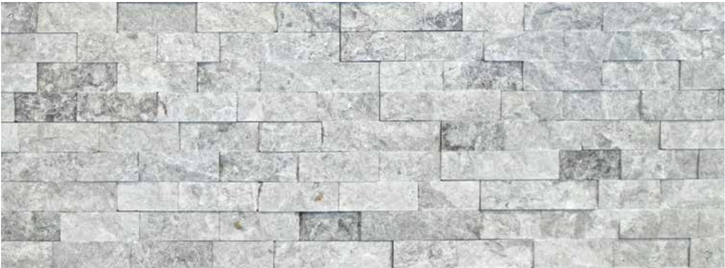
TUNDRA GREY Marble