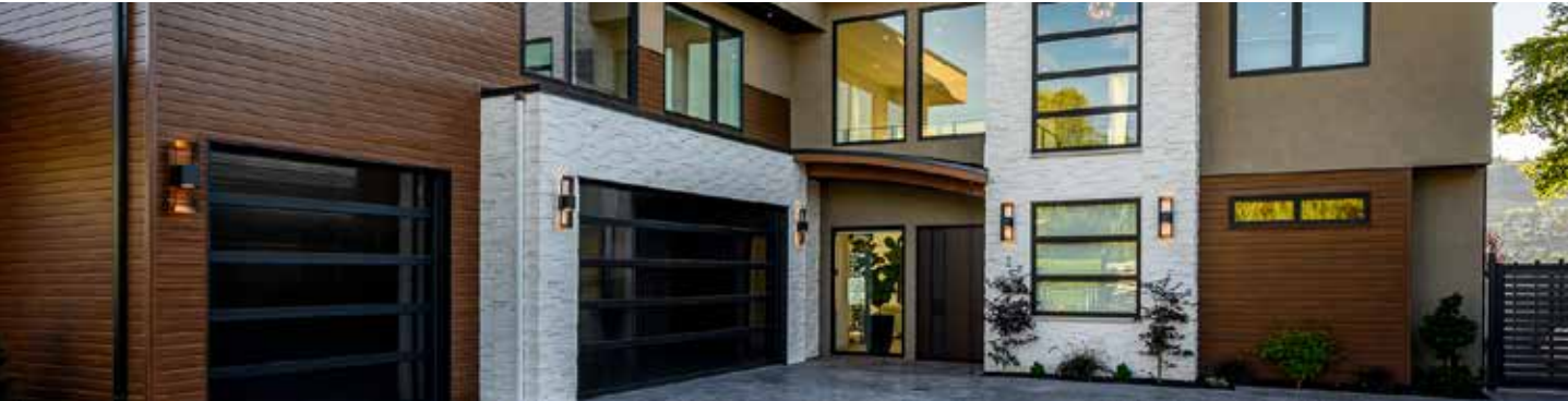
Featured Product - Myra Limestone, 3D

The simple yet clever panel designs of our TIER® Panel System allows each section to interlock seamlessly together, producing all the charm and elegance of a natural stone surface.