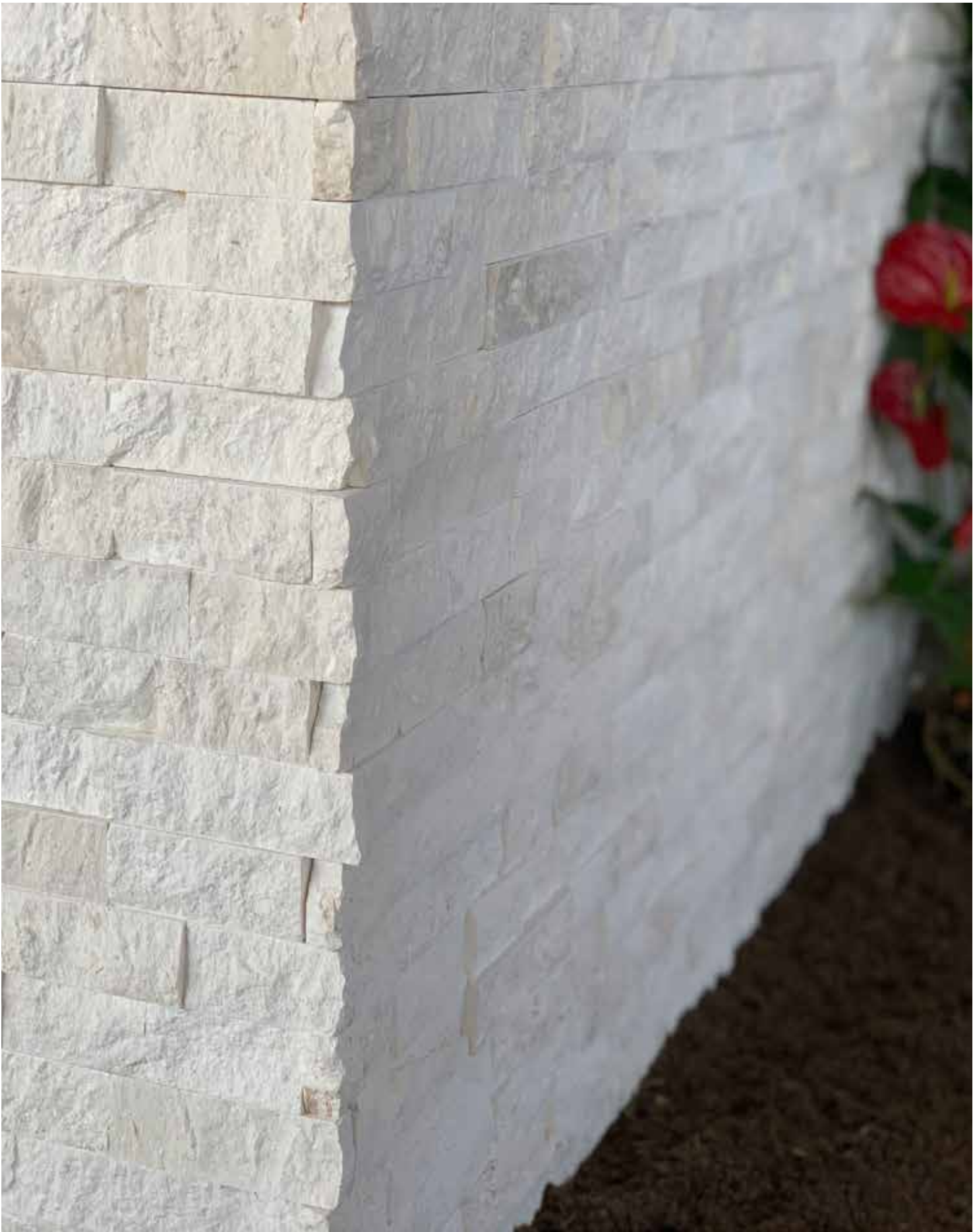
Featured Product - Myra Limestone, CONTEMPORARY