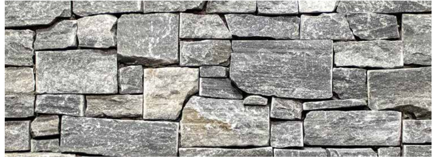
GREY SLATE Slate

*See page 15 for Corner & Starter Strip specifications.