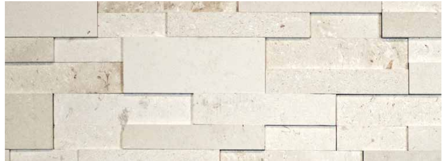
MYRA LIMESTONE Limestone